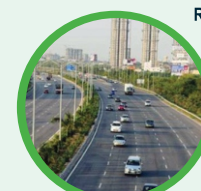
Yadadri & Cherial 150R 4 Lane Road (KYKK Corridor)