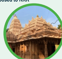
World Famous Jain Temple at Kolanupaka