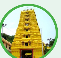
Komuravelli Mallanna Temple